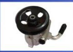
Power Steering Pump