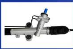
Power Steering Rack