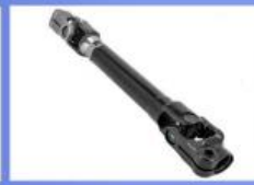
Steering Column Shaft