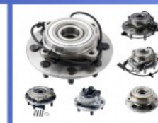
Wheel Hub Bearing