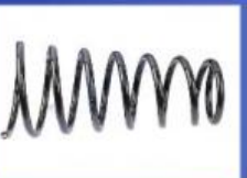
Shock Absorber Spring