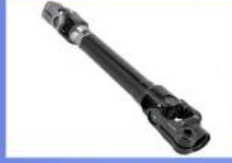
Steering Column Shaft