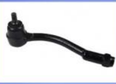
Tie Rod End