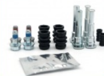
Brake Repair Kit