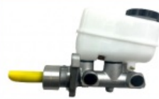
Brake Master Cylinder