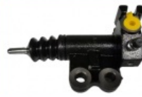
Brake Slave Cylinder