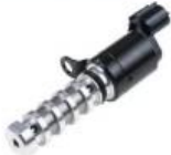
Oil Control Valve