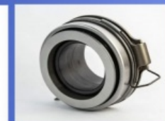
Clutch Release Bearing