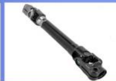
Steering Column Shaft