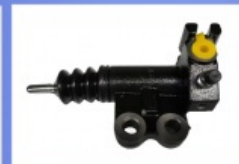
Brake Slave Cylinder