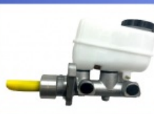
Brake Master Cylinder