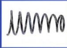
Shock Absorber Spring