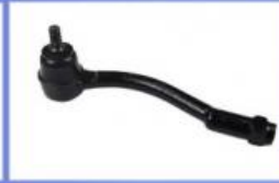
Tie Rod End