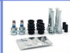
Brake Repair Kit