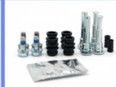
Brake Repair Kit