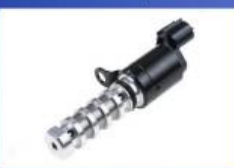
Oil Control Valve