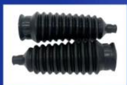
Steering Gear Boots