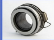
Clutch Release Bearing