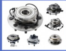
Wheel Hub Bearing