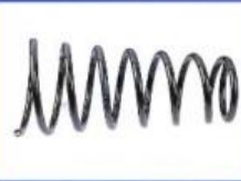
Shock Absorber Spring