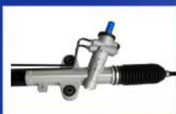
Power Steering Rack