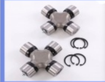
Universal Joint Bearing