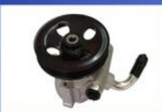
Power Steering Pump